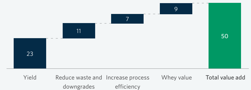
Value levers $/ton of cheese

Streamline your process to streamline your outcomes, giving your customers the best in every batch.