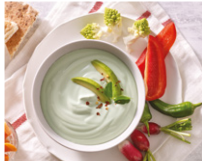
Avocado yogurt dip