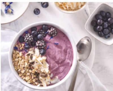
Açaí breakfast bowl

Catch the eye of the consumer with unique and authentic flavors