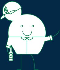
NEER® Poly the neutral & versatile

SmartBev® NEER® is a technology based on Pichia kluyveri yeast that creates the full beer experience without the alcohol (0.0%ABV)